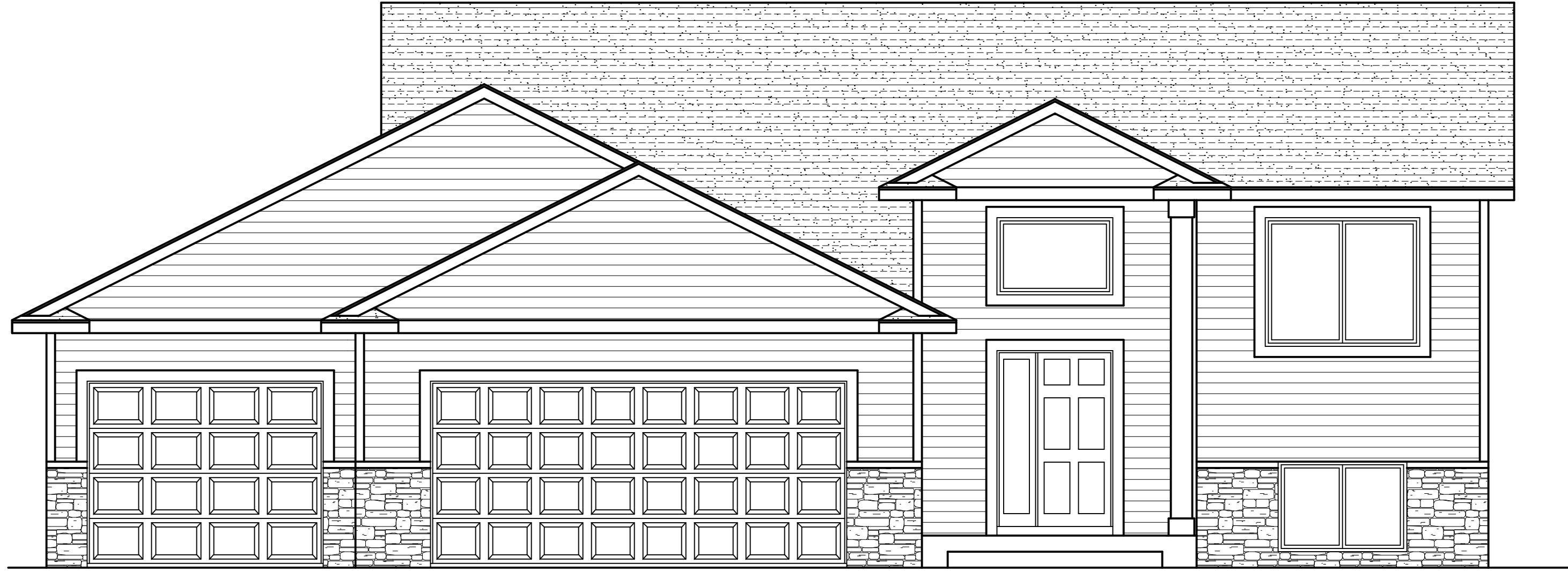
FRONT ELEVATION SCALE 1/4"=1'-0"